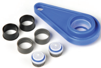
Twin tap inserts