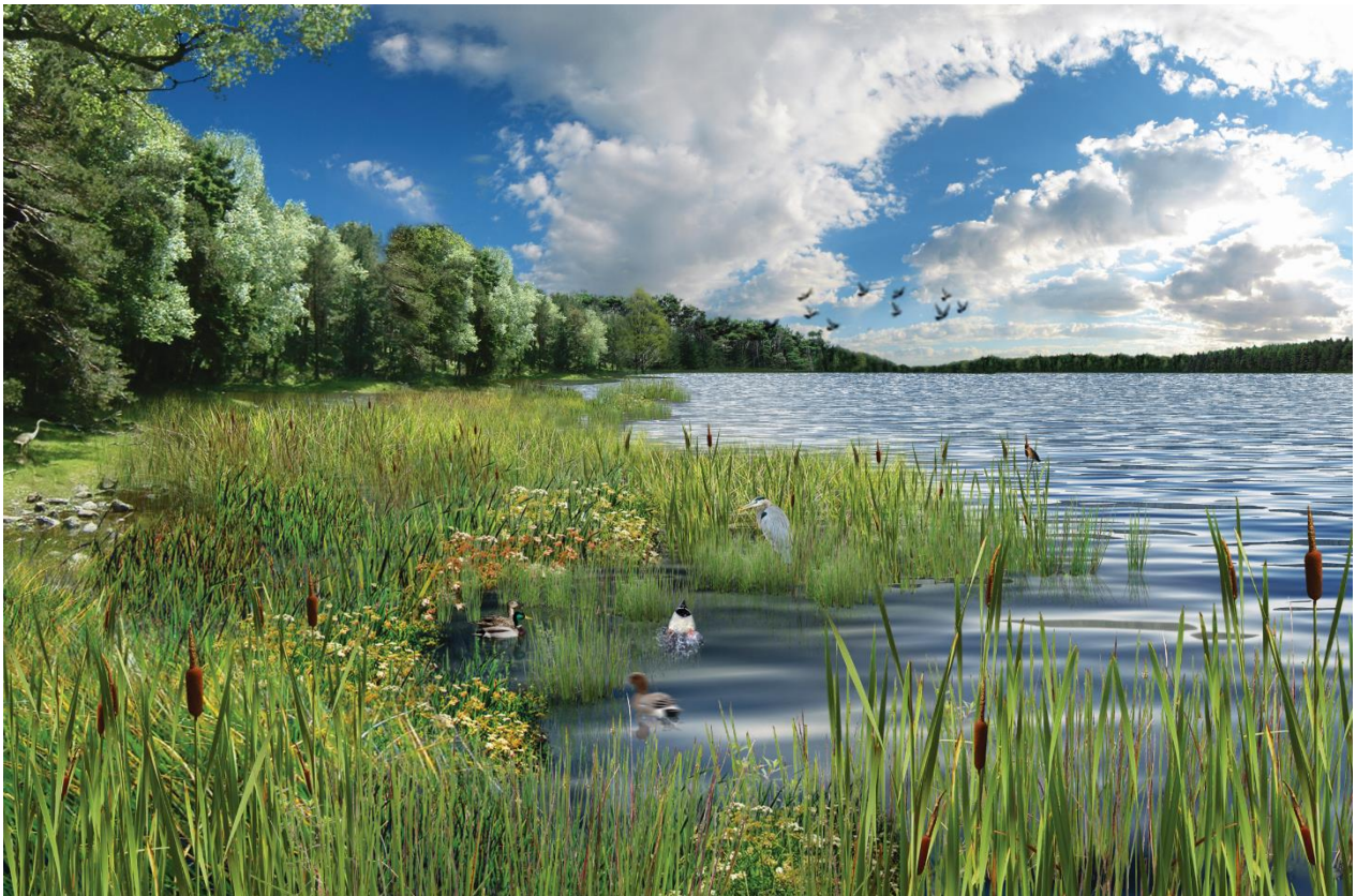
Havant Thicket Winter Storage Reservoir