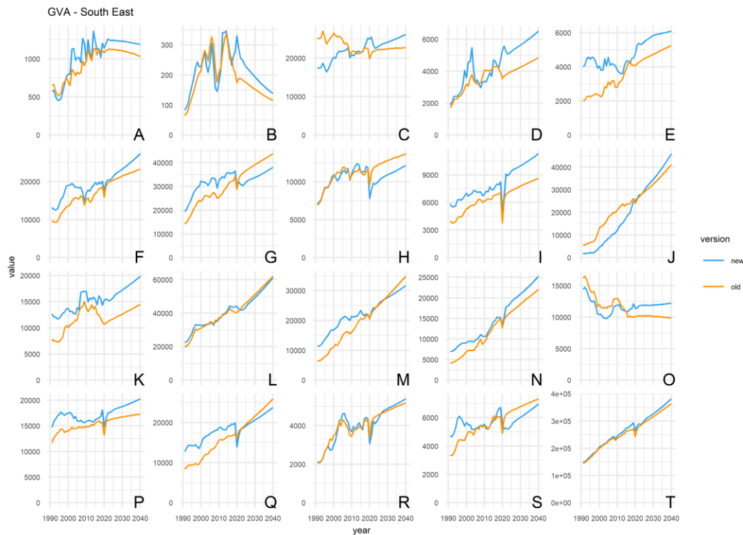
Figure 1 - Updated vs Original Oxford Economics forecast by SIC group

Upon our initial QA checks upon receipt of this data, it was clear that there were significant changes to the economic forecast, not only looking ahead, but also historically. This causes significant issues as the models are trained on specific data, and this data needs to be consistent for an updated forecast to be calculated. Figure 1 shows the differences in GVA forecast after the data updates. There are historical changes in all SIC groups, but most notably in groups C and E.